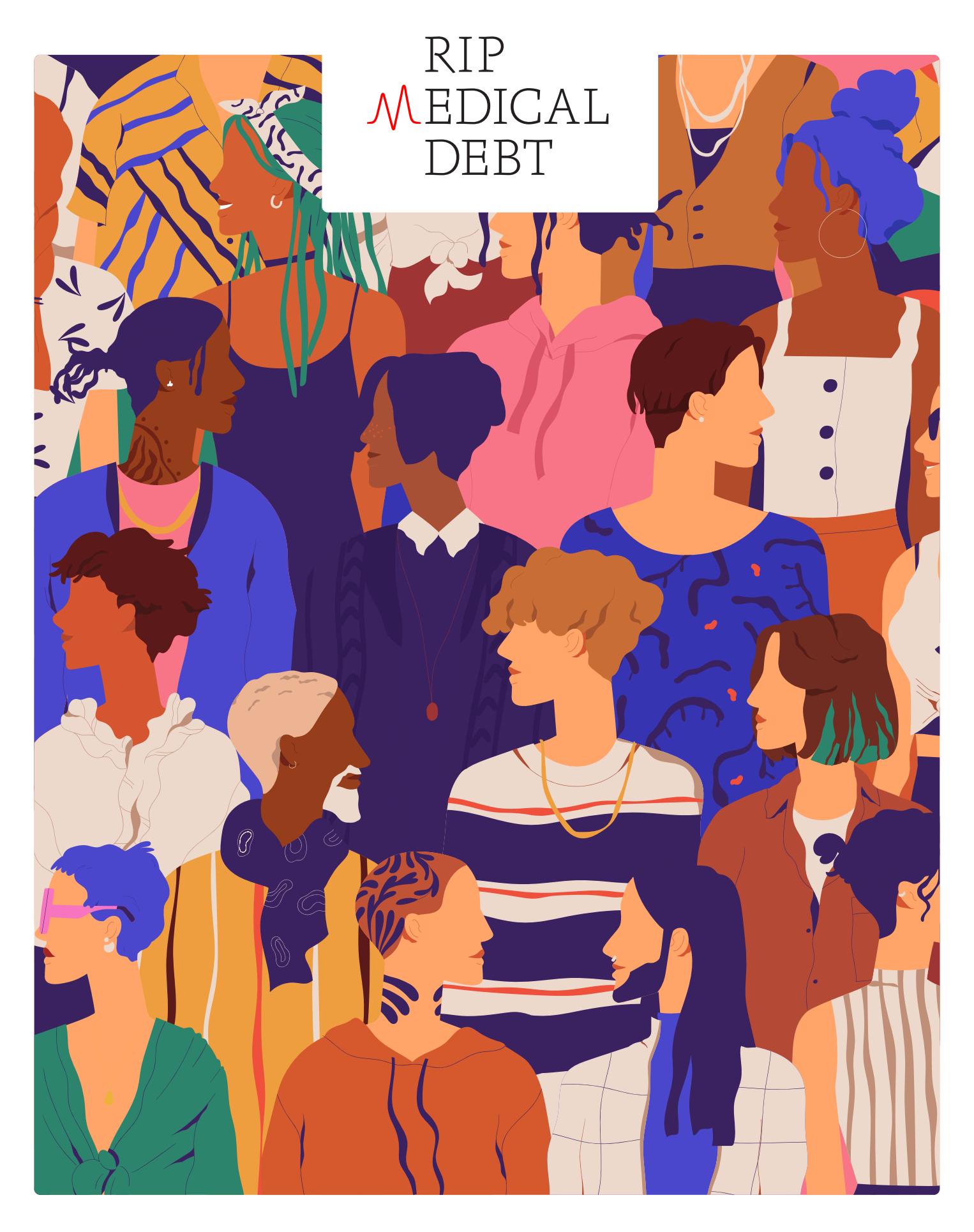
2021 Impact Report